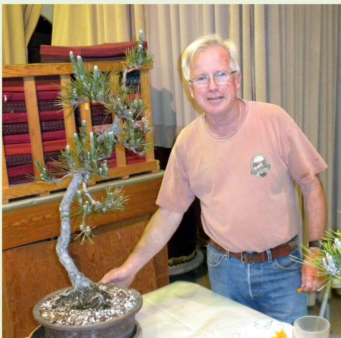
Black Pine – by Brian Conway